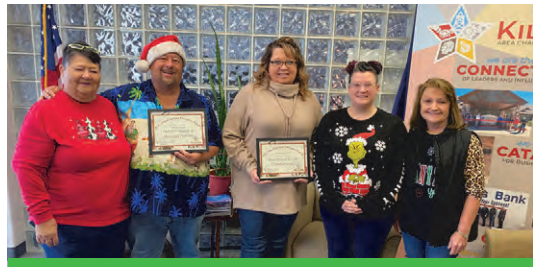
Best Use of Theme Business