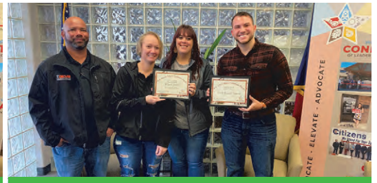
Best Use of Theme Group