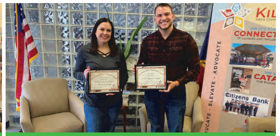
Best Decorated Group