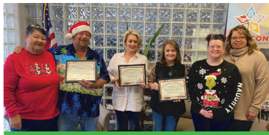
Best Decorated Business

We have a tie. Both have a score of 50. Rusk County Electric Cooperative, Inc. Faith Baptist Church