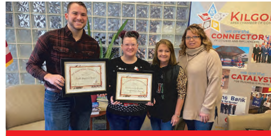
Best Overall in Show