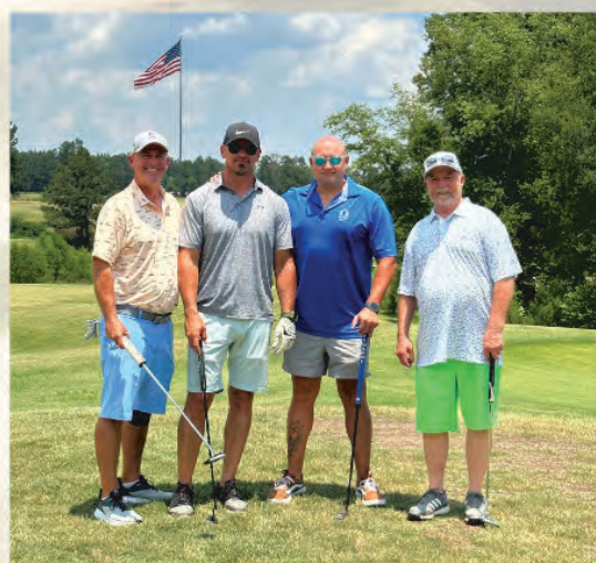
2nd Place National Wholesale Supply -17, 55