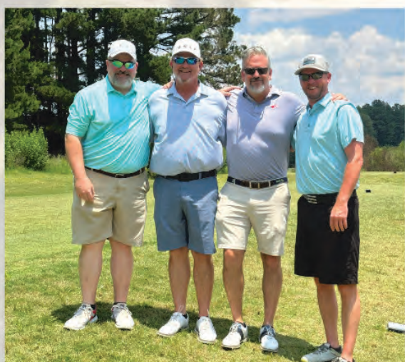
1st Place Tyler Pipe -19, 53