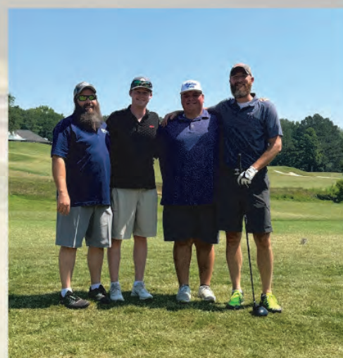
3rd Place Appraisal Resource Group -16, 56